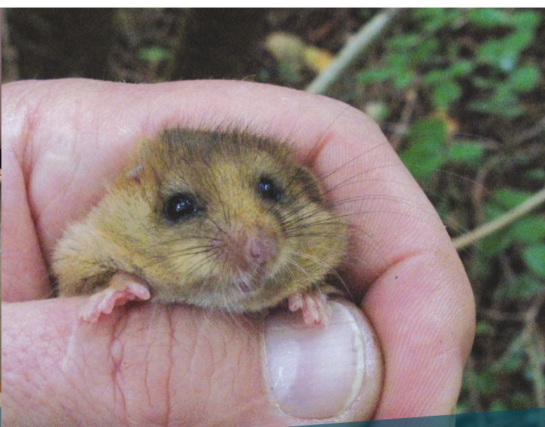
Bovey Valley Woods – ancient woodland and mosaic habitat restoration