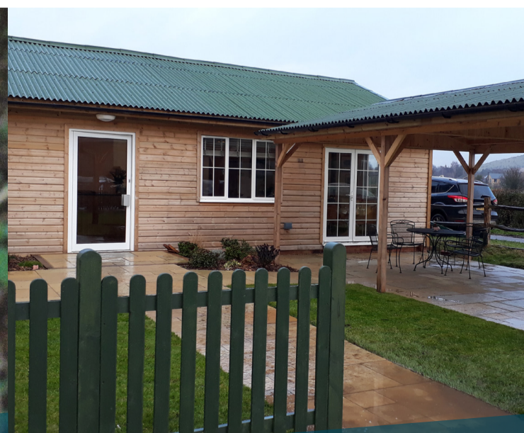
River Bourne Community Farm