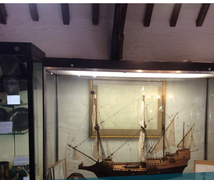
Old Guildhall Museum, Looe – lighting and heating