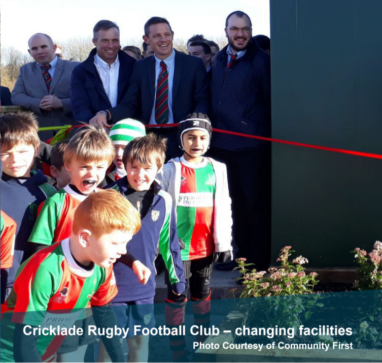
Cricklade Rugby Football Club – changing facilities