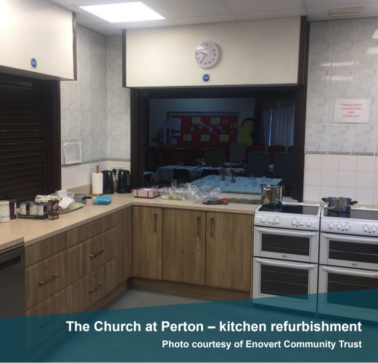
The Church at Perton – kitchen refurbishment