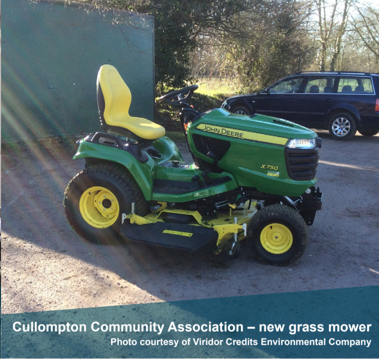
Cullompton Community Association – new grass mower